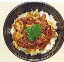
23. TORI TERIYAKI DON RM7.80 Pan fried chicken teriyaki served on rice