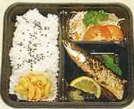
7. SANMA SHIOYAKI RM7.80 Grilled sanma with salt served with rice, salad and macaroni