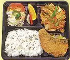
B6. BUTANIKU KIMUCHI SET RM14.00 Pan fried pork with korean pickled served salmon, fried vegetable, rice, salad, pickled and fruits