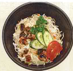
22. UNAGI SALAD RM5.80 Grilled eel with sauce served with salad and wafu dressing