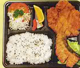
B4. TONKATSU SET RM14.00 Deep fried pork served with salmon, fried vegetable, rice, salad, pickled and fruit