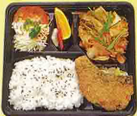
B1. TORI KIMUCHI SET RM13.00 Pan fried chicken with korean pickled served with salmon, rice, salad, pickled and fruits