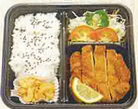
16. TONKATSU RM10.80 Deep fried pork served with rice, salad and macaroni