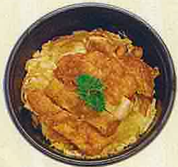
26. TORI KATSU DON RM7.80 Deep fried chicken, onion, mushroom and egg boiled with sauce served on rice