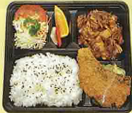
B7. TORI TERIYAKI SET RM14.00 Pan fried chicken teriyaki served with salmon, fried vegetable, rice, salad, pickled and fruits