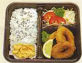
5. IKA FURAI RM7.80 Deep fried squid served with rice, salad and macaroni