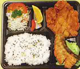
B2. TORI KATSU SET RM13.00 Deep fried chicken served with salmon, fried vegetable, rice, salad, pickled and fruits