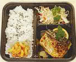
2. SABA SHIOYAKI RM7.80 Grilled saba with salt served with rice, salad and macaroni