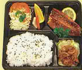
B14. UNAGI KABAYAKI SET RM18.00 Grilled eel served with chicken, fried vegetable, rice, salad, pickled and fruits