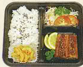
14. UNAGI KABAYAKI RM9.80 Grilled eel with sauce served with rice, salad and macaroni