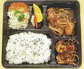
B10. CHICKEN AND SALMON TEPPANYAKI SET RM15.00 Teppankay chicken and salmon served with fried vegetable, rice, salad, pickled and fruits