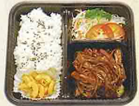
15. BUTANIKU SHOGAYAKI RM10.80 Pan fried pork with ginger sauce served with rice, salad and macaroni