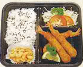
17. EBI FURAI RM10.80 Deep fried prawn served with rice, salad and macaroni