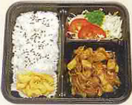
11. TORI SHOGAYAKI RM9.80 Pan fried chicken with ginger sauce served with rice, salad and macaroni