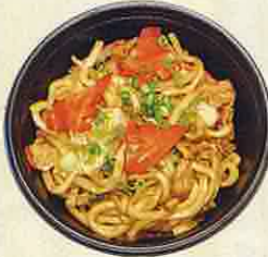
27. YAKI UDON RM11.80 Fried noodles with pork and vegetable.