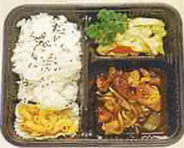
12. TORI TEPPANYAKI RM9.80 Teppanyaki chicken served with fried vegetable, rice and macaroni