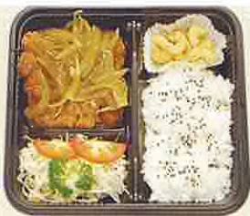
20. KATSU KARE RM12.80 Deep fried pork served with curry, rice, salad and macaroni