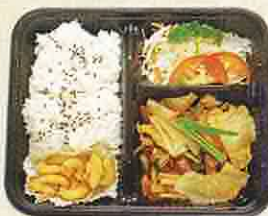
18. BUTANIKU KIMUCHI RM10.80 Pan fried pork with korean pickled served with rice, salad and macaroni