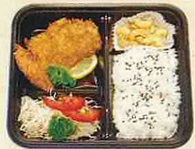
10. TORI KATSU RM8.80 Deep fried chicken served with rice, salad and macaroni