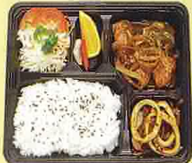
B11. SEAFOOD TEPPANYAKI SET RM14.00 Teppankay salmon and squid served with rice, salad, pickled and fruits