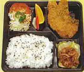
B3. SALMON FRIED SET RM14.00 Deep fried salmon served with chicken teriyaki, rice, salad, pickled and fruits