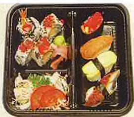
21. SUSHI BENTO RM13.80 Ebi furai maki, unagi sushi, salmon sushi, ebiko sushi, tamago sushi and salad