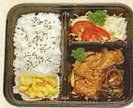
8. SHAKE BATAYAKI RM8.80 Pan fried salmon batayaki sauce served with rice, salad and macaroni