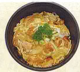
24. OYAKODON RM7.80 Boiled chicken, onion, mushroom and egg with sauce served on rice