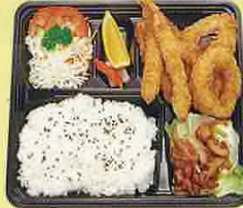
B9. SEAFOOD MIX FRIED SET RM14.00 Deep fried salmon, prawn and squid served with chicken, fried vegetable, rice, salad, pickled and fruits