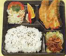
B8. SALMON SAUTE SET RM14.00 Pan fried salmon served with chicken, fried vegetable, rice, salad, pickled and fruits