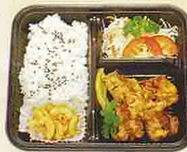
4. TORI KARAAGE RM7.80 Deep fried chicken served with rice, salad and macaroni