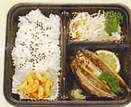
3. KOMOCHI SHISHAMO RM7.80 Grilled shishamo served with rice, salad and macaroni