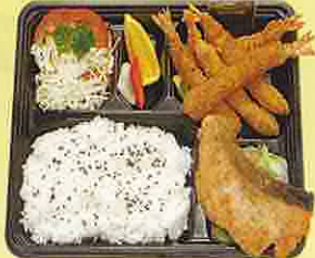
B5. EBI FURAI SET RM14.00 Deep fried prawn served with salmon, fried vegetable, rice, salad, pickled and fruit