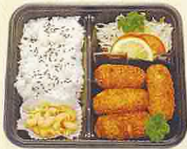
1. KOROAKE RM6.80 Deep fried potato served with rice, salad and macaroni