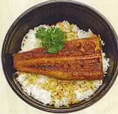
28. UNA DON RM11.80 Grilled eel with sauce served on rice