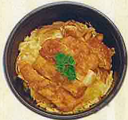
25. KATSU DON RM7.80 Deep fried pork, onion, mushroom and boiled egg with sauce served on rice