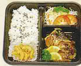
9. SABA TERIYAKI RM8.80 Pan fried saba with teriyaki sauce served with rice, salad and macaroni