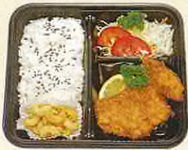
6. SALMON FRIED RM7.80 Deep fried salmon served with rice, salad and macaroni