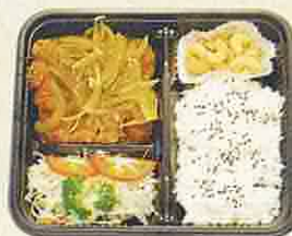
19. TORI KATSU KARE RM11.80 Deep fried chicken served with curry, rice, salad and macaroni

Present this coupon and get FREE unagi salad dine-in only