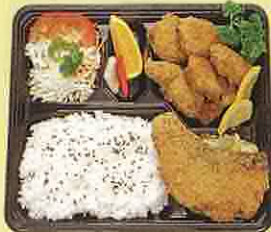
B12. KAKI FURAI SET RM18.00 Deep fried oyster served with salmon, fried vegetable, rice, salad, pickled and fruits