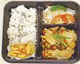
13. TORI KIMUCHI RM9.80 Pan fried chicken with korean pickled served with rice, salad and macaroni