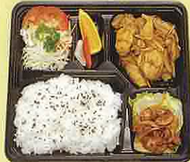
B13. KAKI TEPPANYAKI SET RM18.00 Teppanyaki oyster served with chicken, fried vegetable, rice, salad, pickled and fruits